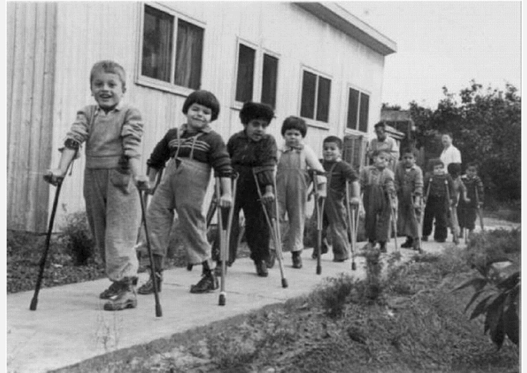
Children with Polio being rehabilitated, Israel, early 1950s